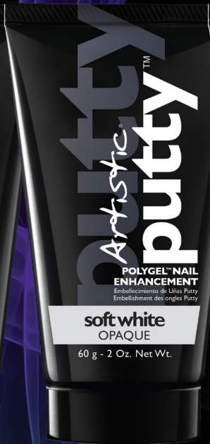
soft white OPAQUE Item# 2810002 60g (2 Oz. Net Wt.)