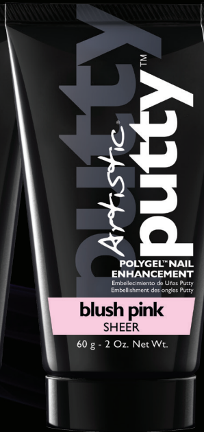
blush pink SHEER Item# 2810003 60g (2 Oz. Net Wt.)