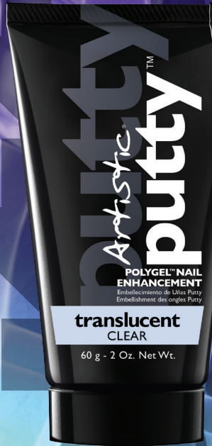
translucent CLEAR Item# 2810000 60g (2 Oz. Net Wt.)