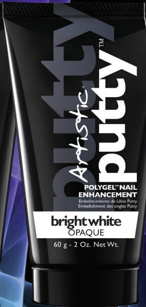
bright white OPAQUE Item# 2810001 60g (2 Oz. Net Wt.)