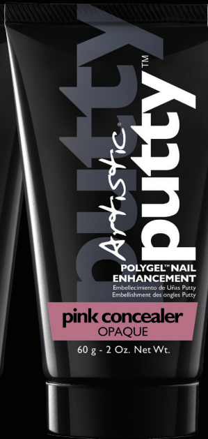
pink concealer OPAQUE Item# 2810004 60g (2 Oz. Net Wt.)