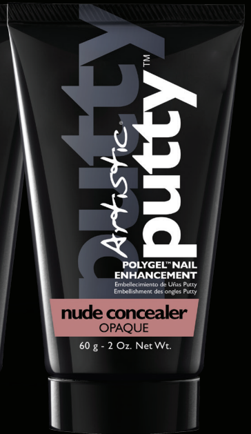
nude concealer OPAQUE Item# 2810005 60g (2 Oz. Net Wt.)