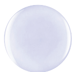
CLEAR ITEM #2713211