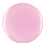
LIGHT PINK ITEM #2713212